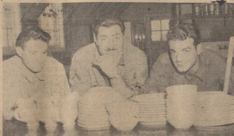
Among the first men to pull KP in the 30th Division here were