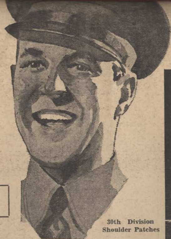
30th Division Shoulder Patches