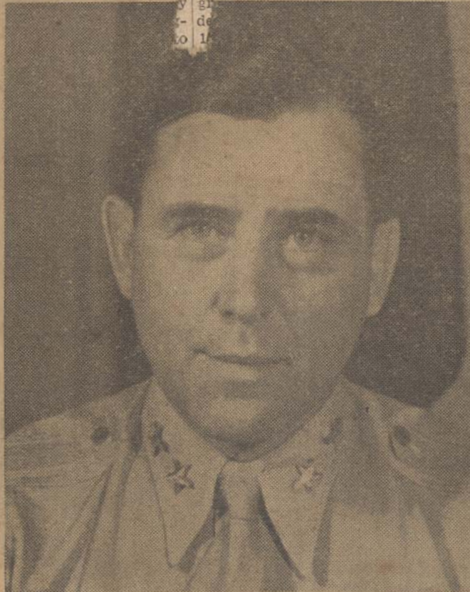
MAJ. GEN. LELAND S. HOBBS