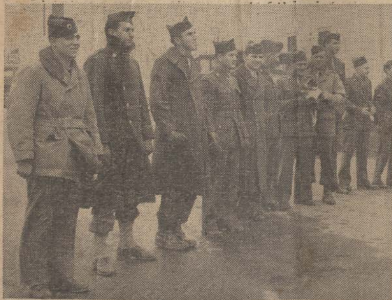
Some 30th Division soldiers who arrived here early are shown giving Division Headquarters the "once-over." Headquarters Co., Quartermaster, and the MP platoon are represented in the picture.