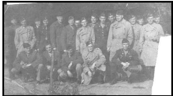
Officer Corps of the 113th Artillery Battalion I'm sixth from the right among those standing